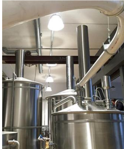
FLECKS Craftbrewery Production 3-5-10-20-30-50 HL