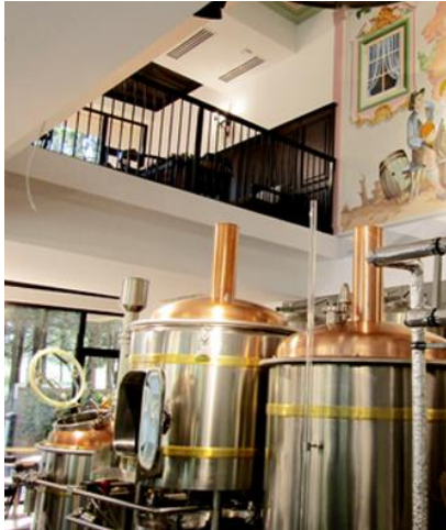
FLECKS Classical Pub brewery 3-5-10-20 HL