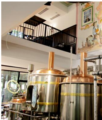
FLECKS Classical Pub brewery 3-5-10-20 HL