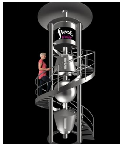
FLECKS HELIX Designer Piece 5 HL

Configure your own brewery with the help of this price list: