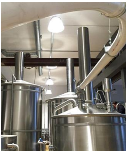
FLECKS Craftbrewery Production 3-5-10-20-30-50 HL